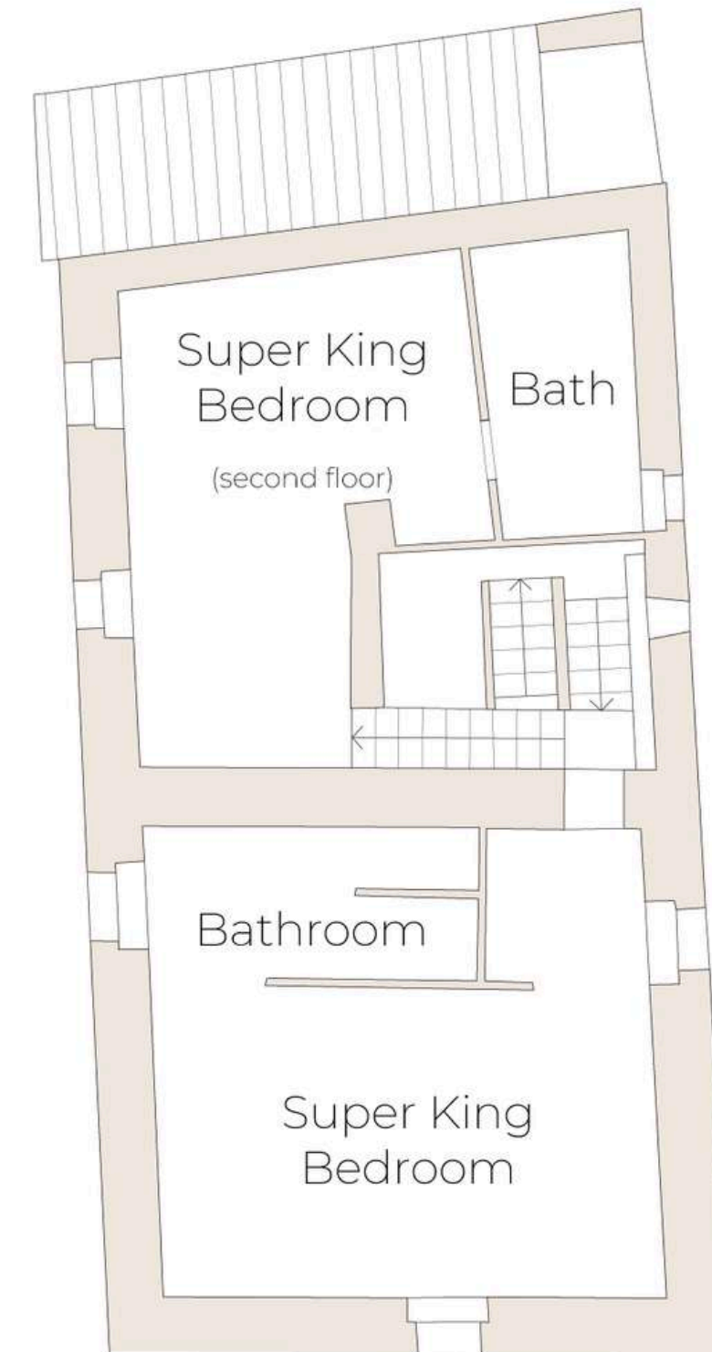
FIRST & SECOND FLOOR